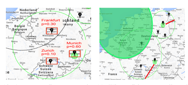
(d) Anycast replicas are geolo- (e) When disks are collapsed cated within disks via a classifi- around geolocated replicas, disks cation problem, by jointly weight- may no longer overlap, and aning latency measurement and city other enumeration/geolocation itpopulation information eration takes place