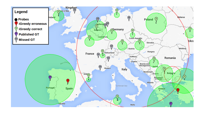
Fig. 2. Final result (root server L in Europe).

The demo is composed of a back-end measurement component and a front-end analysis and visualisation tool. The back-end component is a set of distributed vantage points in PlanetLab with known geographic coordinates in charge of preforming ICMP measurements towards a given anycast IP address. As part of our ongoing effort of performing an